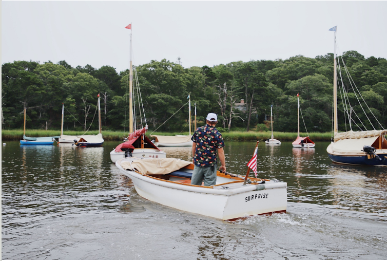
'SURPRISE' our (very quiet) electric launch, powered by renewable energy from solar panels.

Our launch driver service was offered to mooring customers daily from Memorial Day to Labor Day. 'SURPRISE,' our fully electric launch, powered by the solar panels at the waterfront, ran all season.