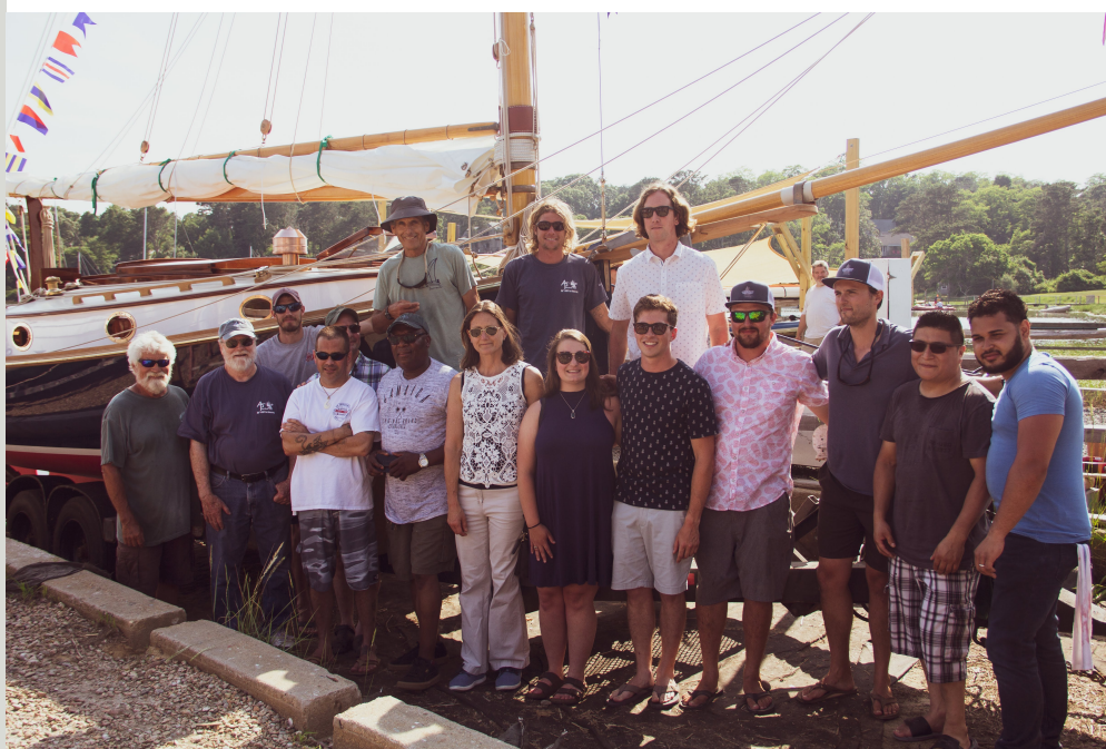
APBY team at the July 4th Launch of Libellule.