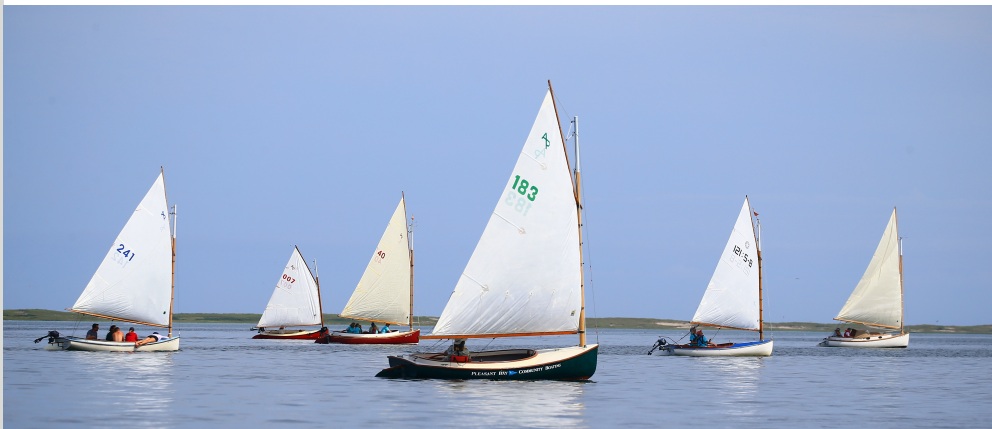
Catboats race in light wind at the 27th Annual Arey's Pond Cat Gathering.

Mid-August always means the Annual Arey's Pond Cat Gathering is near! This year's Gathering on the 17th of August was ruled by light air again. There was just enough wind to get 77 boats (mostly catboats of a variety of designs) around the course. The proceeds of this year's event went to the Friends of Pleasant Bay's efforts to Purchase Sipson Island for use as public land (as opposed to development). You can learn more about their efforts by clicking here .