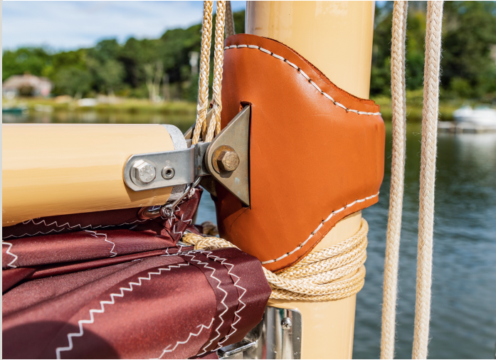
Leathered APBY gaff saddle on 'Nothin' Fancy', a recently launched 16' cabin Lynx.

We are excited to introduce our new and improved gaff saddle, based on the Marshall 15 design. The new saddle features custom bronze hardware, genuine saddle leather, and focused craftsmanship. This tested design is a worthwhile investment for all gaff-rigged vessels.