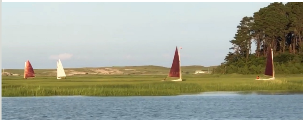
Arey's Pond catboats sail through the Hog Island creek on a Wednesday night sail in July.

Our weekly Wednesday night group sail program continued this summer. One of our best evenings of summer came early with six catboats sailing the Hog Island creek on the tide with a setting sun. It does not get much better than that!