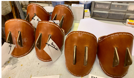
Five of the over twenty gaff saddles that were fabricated by Matt Dooley in our rigging shop this winter.

We have recently released a cancellation policy for mooring customers who will not be able to use their moorings due to the pandemic ( Please visit website for more information ).