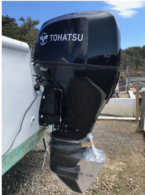
A 25' Novi recently re-powered by Arey's Pond with a 150hp Tohatsu. Let us know if you have a re-power project for us!