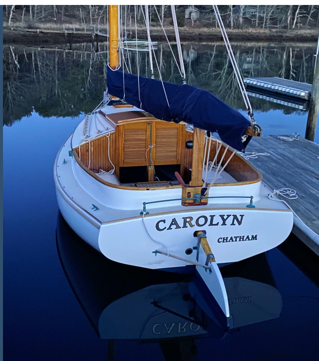
CAROLYN (22' AP catboat) was one of the first boats to start the sailing season at Arey's Pond this year.