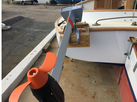
A Torqueedo Travel 1103C (without battery) on a brand new Arey's Pond Cabin Lynx in 2019. Nearly half of the catboats in Arey's Pond are powered using electric engines.

Nearly half of the boats moored in Arey's Pond are powered using electric engines, including Surprise , our electric launch, which is charged using our waterfront solar panels. Our goal is to have 80% of the pond powered by electric engines within the next five years. If you would like more information on Torqueedo electric engines, please visit their website or speak with our service department.