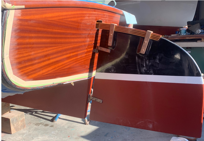
The mahogany veneer transom on a new open cockpit Lynx catboats glows in the sunlight.

At this time we have openings for new builds in both the Lynx 16' and the Cat 14' models. Please contact us for more information.