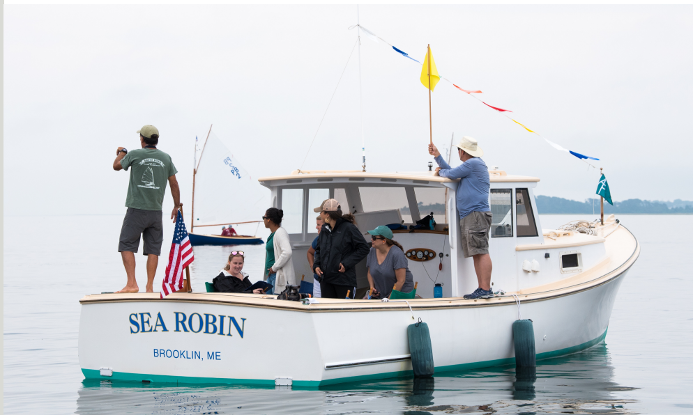
The race committee starts a fleet of catboats at the 26th Annual Cat Gathering in 2018.