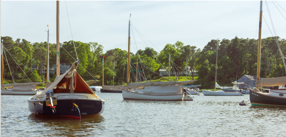
Arey's Pond with a full fleet of moored catboats last summer.

our normal working hours (8am to 4:30pm) Monday through Friday. On weekends we are open for mooring customers only. As of now, we do not have staff on site during the weekends and our bathrooms are closed to customers. We will keep customers updated as this policy changes. Customers should regularly check our website for updates to our COVID-19 policy. Link to the policy can be found by clicking on the top announcement bar on our homepage.