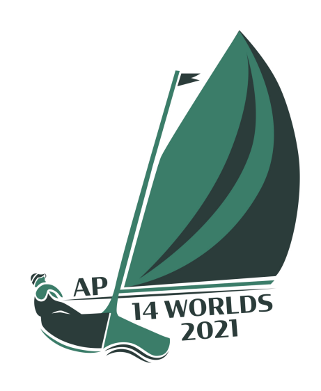
The logo for the first annual AP 14 Worlds.

The regatta will be the best of three US Sailing sanctioned races using a windward-leeward course. Two races will take place in Little Pleasant Bay, and one will take place in Big Pleasant Bay.