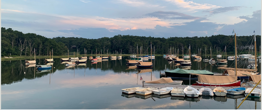
Arey's Pond on a calm evening this past summer.