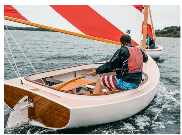
A view of the varnished transom, redesigned rudder, and streamlined cockpit on the 2021 14' Racing Catboat. Pleasant Bay, MA.

The newest model will debut at boat shows in 2021, with hope that it will be the next generation of our fiberglass 14' catboat. Please <u>visit our website</u> for more photos and information.