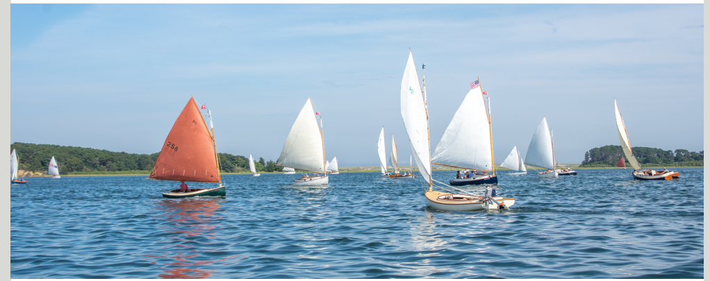
The 28th Annual Arey's Pond Cat Gathering on Little Pleasant Bay. <u>Click here</u> to view all of Nancy's Cat Gathering photos.

Despite the cancellation of sailing events all over the world, we were able to host our annual Cat Gathering with some adjustments for safety. We're very lucky that our event allows for participants to stay isolated in their own boats. Our skipper's meeting and post race awards ceremony were held virtually on Zoom and the reception party was postponed until our event in 2021.