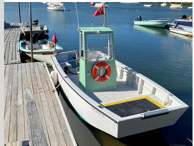
The line up of APBY service boats. Keep an eye out for them on Pleasant Bay!

Keep an eye out for Wolfi on Pleasant Bay with catboats in tow!