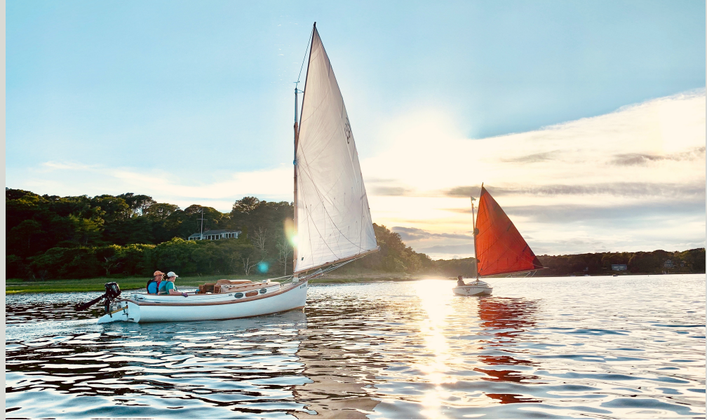
Catboats sail back to Arey's Pond at the end of a Wednesday Night Sail this summer.

This summer was one of the best ever for sailing on Cape Cod. Arey's Pond held our longstanding tradition of Wednesday Night Sails where catboats from all over Pleasant Bay sailed together on Wednesday evenings. This summer, the Wednesday Night Sails were extra special because they were a safe way for us to see each other from afar and gather in a shared experience.