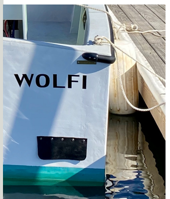
Wolfi is named in memory of a very special boat yard dog.

Our waterfront service team has been in need of a new work boat for hauling mooring and delivering and picking up boats across the bay. After considering options, we decided to design and build our own to replace our old Carolina Skiff.