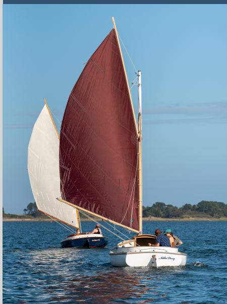
An Open Lynx (left) and Cabin Lynx sail in Pleasant Bay last fall.