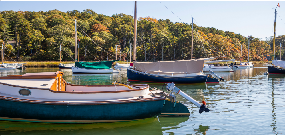
Torqeedo electric engines on the stern of many catboats in Arey's Pond

Imagine this, in the future every boat in Arey's Pond under the displacement of 2500 lbs (which is the majority) will be powered by electric motors. Before too long, this will be our reality because electric engines are the future of boating. To meet demand, we are quickly becoming the leading supplier of electric outboards and inboards on Cape Cod.