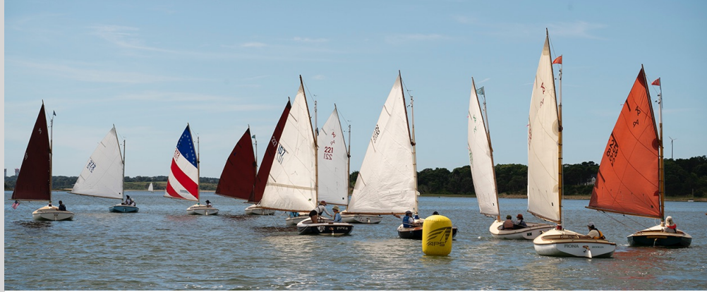
Sailors round a mark at the first ever AP 14 Worlds.

On August 21st, Arey's Pond Boat Yard hosted the very first <u>AP 14 Worlds Regatta</u>. The one-day event proved to be competitive and fun despite some light and variable air conditions. Thirty-four AP cats, spanning the 52 years of the design's history, sailed a short windward-leeward course with an offset.