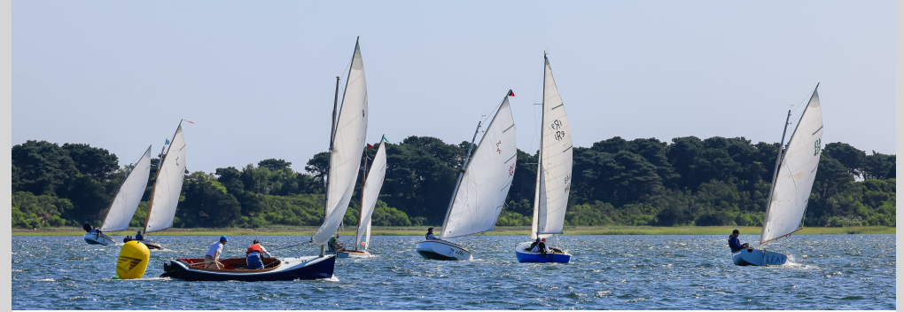
Sailors round a mark at the Namequoit Sailing Association series.

The <u>Namequoit Sailing Association summer racing</u> season kicked off the last weekend in June and every Sunday through August, a race or two happened in Little Pleasant Bay. A lot of fun was had mixing it up between the 14' catboats, Baybirds, 16' to 18' catboats and Rhodes 19's. This year was no exception. Despite fewer 14' catboats than years past, some great racing was enjoyed. Next season we need more 14's and Beetles!