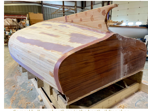
Caracal hull number three in the boatbuilding shop this past November.

<u>CARACAL</u>, hull number three, is coming along in our boatbuilding shop. This 19' catboat will be launched in 2022 and will be the first Caracal to have an inboard OceanVolt electric engine.