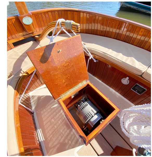
Inboard electric OceanVolt engine in an AP Open Lynx catboat.

catboats. With the upcoming addition of engines in two 19' AP Caracals, we will become the leading OceanVolt US partner with more installs than any other US boatbuilder.