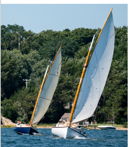
An Cat Mahair (left) and Pandora (right) sail in the Cat Gathering.

The course was ideal, with many lead changes and top finishers. Three races were sailed in the morning and two in the afternoon, which made for a full day and lots of anticipation as Hurricane Ida was bearing down on Cape Cod and predicted to land on the east coast within 48 hours. All of us at Arey's Pond are eagerly anticipating the recognition of <u>our AP 14 cats</u> as a new US Sailing one-design class. Sailors with 14's will be officially included in sailing events all over the country and...the world! <u>View</u> <u>results for the AP 14 Worlds here on our</u> website.