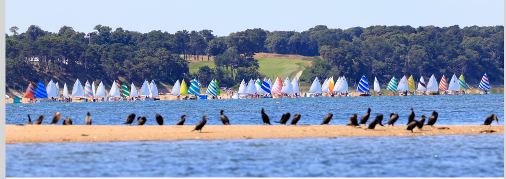
Telesmanick participants line up for a start in Pleasant Bay. Cormorants look on.

The following weekend, Chatham Yacht Club hosted their annual regatta on August 6th and 7th. This year was special because it was the club's 100th Anniversary, along with the 100th year of the Baybird design, which was part of the sailing fleet when the club opened in 1921. As good luck would have it, the back-to-back big anniversary weekends had ideal weather and wind conditions to get all the races in.