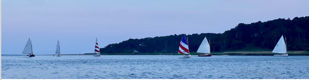
Wednesday Night sailors head back to Arey's Pond at sunset one evening this past summer.

<u>Wednesday Night Sails</u> have been part of the Arey's Pond summer schedule for a number of years now, this year was one of the best. Every Wednesday evening all summer long, there was great wind and weather to enjoy sailing as a group from Namequoit Point to Big Pleasant Bay and back, or if the tide was right, through the shallows and creeks on the backside of Hog Island.