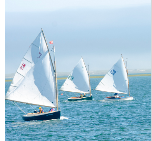
Cat Gathering participants sail through Little Pleasant Bay.

On Saturday, August 22nd, with Hurricane Ida still heading towards New England and expected to make landfall later in the day, somewhere between the South Shore of Massachusetts and Long Island, the crew at Arey's Pond and the Orleans Harbor Master concluded, based on the hurricane tracking models, that we would be clear to go ahead with the Gathering as scheduled. Although, we decided to not have the shore side party and awards celebration in order to give people time to prepare.