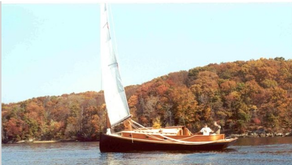
Dolphin sailing on the Connecticut River after major restoration in the 1990's ( photo source ).