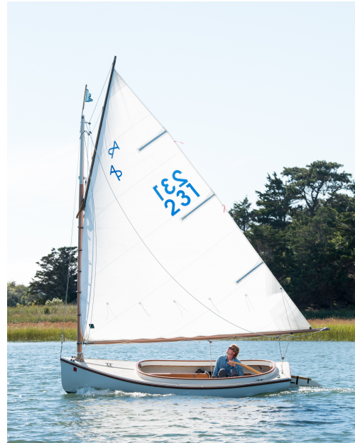
Hull 231 sails past Hog Island.