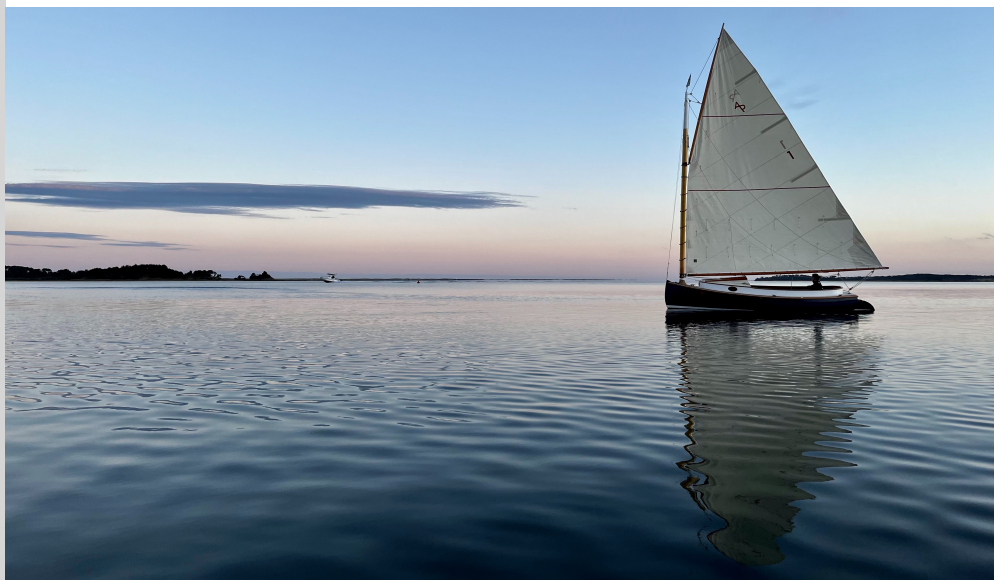
Arey's Caracal 'An Cat Mathair' sails into the sunset on a 'glassy' Little Pleasant Bay.

The first 19' Arey's Caracal catboat was launched in 2014 and received lots of attention, including an article in Small Boat Magazine . Hull number two was launched in 2017, number three is slated for launch in 2022, and by 2024 five Caracals will be sailing!