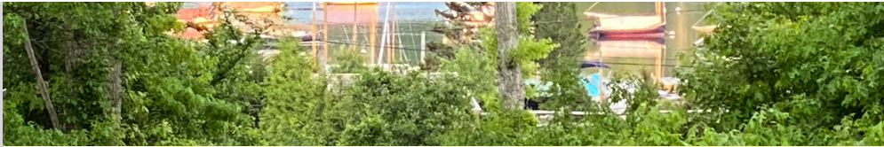
A view of Arey's Pond through the trees.

This spring marks my 31st season at Arey's Pond; I clearly remember three decades ago, standing at the waterfront wondering what I had done. Owning a business at that stage in my career was a learn-by-doing proposition.