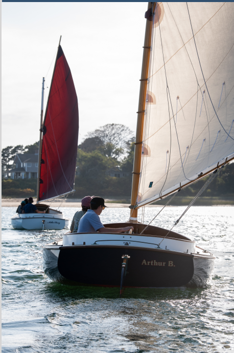
Arey's Lynx catboats sail towards the Narrows.