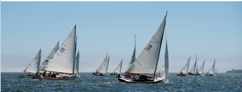
Big Cats sail in Little Pleasant Bay at the 29th Cat Gathering.

All of us at Arey's Pond are so grateful for the sailing community on Pleasant Bay's support of this event. It has been rewarding to watch it grow into the highly anticipated event it is today. We regularly have over 100 boats sailing, and are able to raise funds for the Friends of Pleasant Bay 's efforts to preserve and protect the beautiful waters we are so lucky to call 'home.'