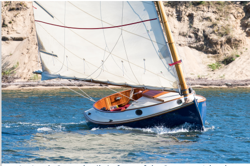
An Arey's Caracal sails in front of the Sampson Island bluffs.

Caracal hull numbers three and four will be powered by OceanVolt inboard electric engines. Arey's Pond is at the forefront of marine electric engines and we believe they're the future of the industry. With the upcoming addition of these two engines in the Caracals, we will become the leading OceanVolt US partner with more installs than any other U.S. boatbuilder!