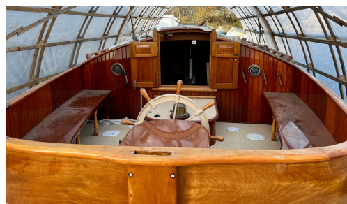
Dolphin's cockpit prior to expansion for charter sails with Catboat Charters on Martha's Vineyard.