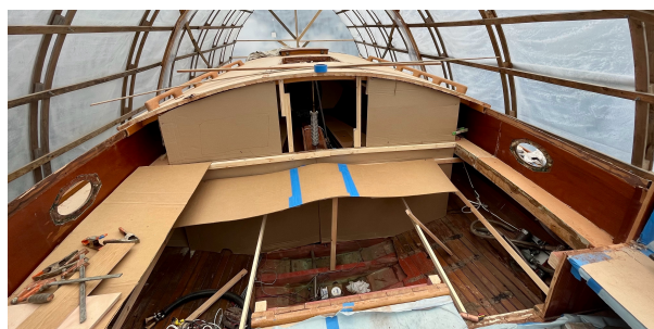
Dolphin's cockpit in the process of being expanded to seat additional charter guests.

Our boatbuilders are in the process of expanding her cockpit to accommodate additional charter guests. In the photo below cardboard templates show layout of additional seating and new bulkhead.