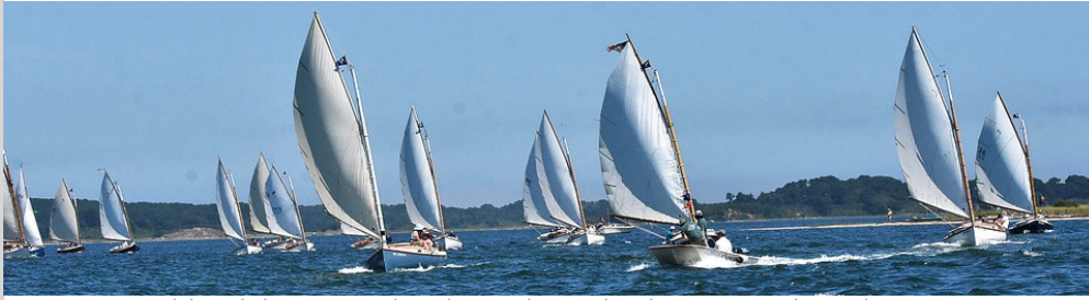
Participants sail through the narrows at the 29th Cat Gathering.