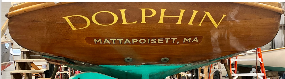
DOLPHIN's transom in the boatbuilding shop at Arey's Pond.