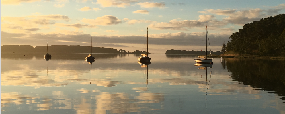
In the early morning, Arey's Pond Sailing School boats sit on their moorings in Little Pleasant Bay.