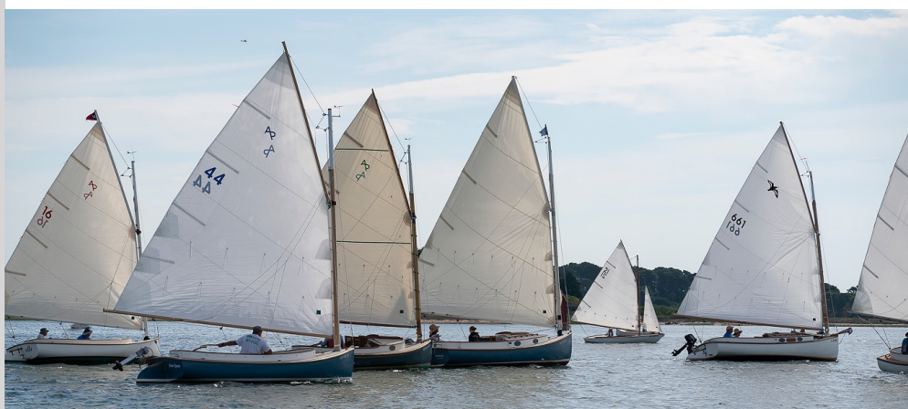
Catboats sail in the 30th Cat Gathering.