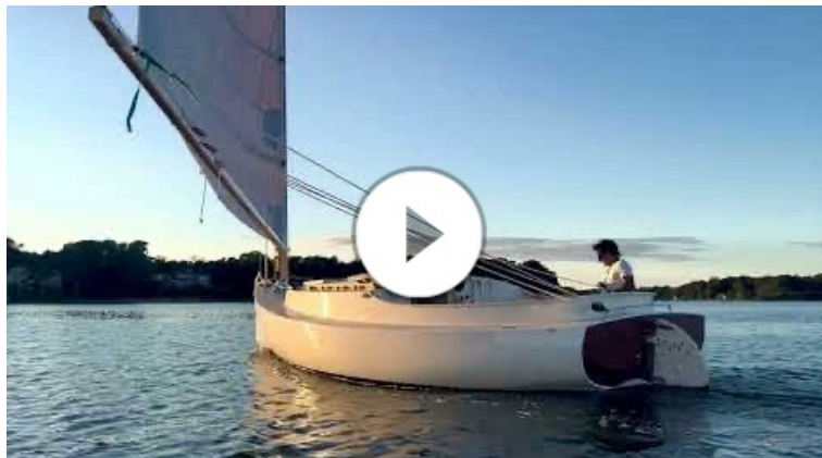
Arey's XFC 22 sails by at golden hour!

The 2022 WoodenBoat Show was extra special because we brought our newest design, the XFC 22 , a catboat built for racing and performance. It was very well received by show attendees and we were honored to receive the award for Best Professionally Built Sailboat.