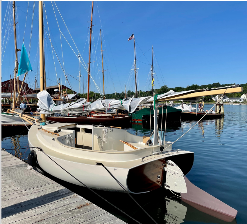
The XFC 22 on the dock at the Wooden Boat Show in Mystic, CT.

This past June, we attended the WoodenBoat Show in Mystic, CT. This show is one of our favorites every year. It is a great mix of new and restored wooden boats presented by builders and designers. It takes place on the Mystic Seaport Museum campus, which is a must-visit location for anyone who loves classic boats and maritime history.