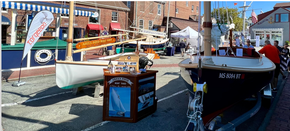
Arey's Pond display at the Newport Boat Show in August.

Torqeedo specializes in small outboard electric engines, but also offers larger outboards and inboard pod drives. So far in 2022, we have sold 19 outboard Torqeedo engines to customers all over New England. If you are interested in purchasing a Torqeedo from us, we offer free shipping, which is an even better offer than you'd get purchasing directly from Torqeedo.