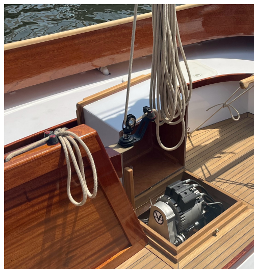
Inboard electric OceanVolt engine in a Arey's Pond 19' Caracal launched this summer.