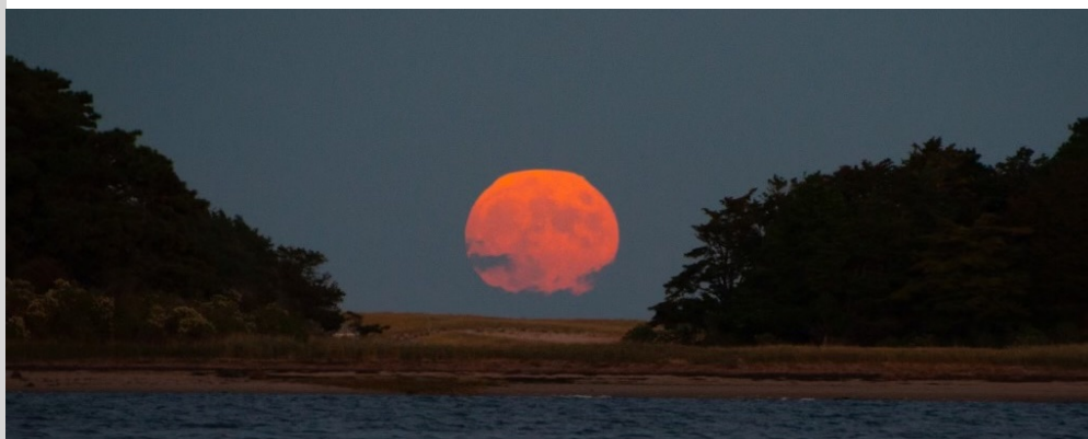
The harvest moon sets over Nauset Beach this past October.