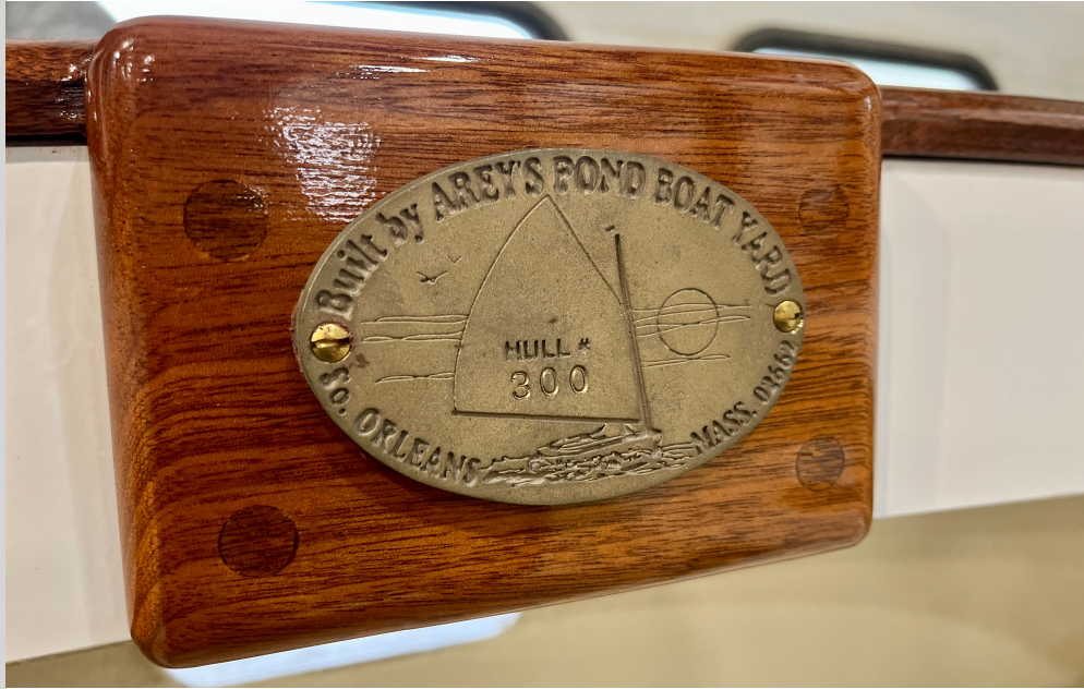
Builder's plate on the 300th Arey's Pond 14' catboat.

This spring and summer our boatbuilding team was busy finishing up the third hull of our 19' Caracal Catboat design , the award winning XFC 22 , two 16' Open Cockpit Lynx Catboats and two 14' Arey's Catboats including hull number 300 of that design!