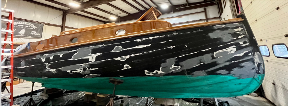
DOLPHIN in the boatbuilding shop at Arey's Pond.

We are expanding the cockpit to accommodate more charter guests, installing a head, re-powering the boat with a new Beta 30 diesel engine, along with many other smaller modifications. We can't wait to see this beautiful piece of history sailing the waters of Martha's Vineyard once again!