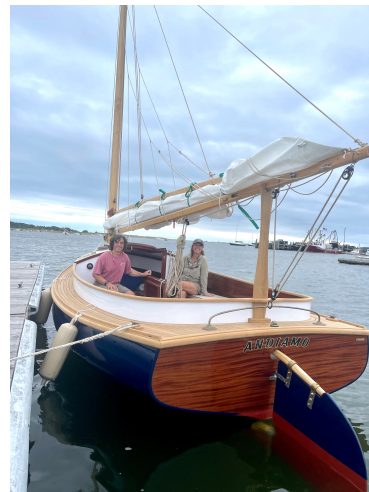
New owners of Caracal hull number three 'ANDIAMO' before their inaugural sail.

There has been a lot of interest in our Caracal design over the years and this mold will allow us to get the base price down 20% from the cold-molded wood hull. With this hybrid-method of a wood deck and cabin built to a fiberglass hull, we will still be able to customize the boat to meet the owners' specific needs.