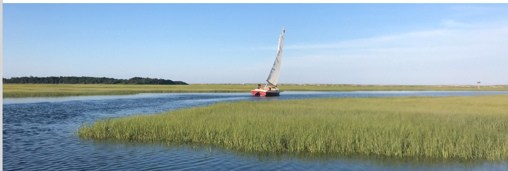
A catboat sails through the Hog Island creek at a Wednesday Night Sail this past summer.