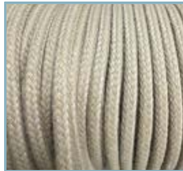
5/16" Vintage Double Braid