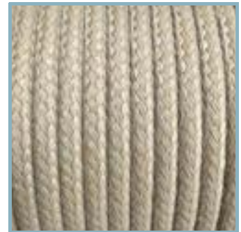
3/8" Vintage Double Braid