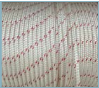
3/16" Double Braid