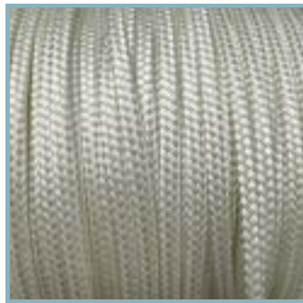
1/4" Double Braid