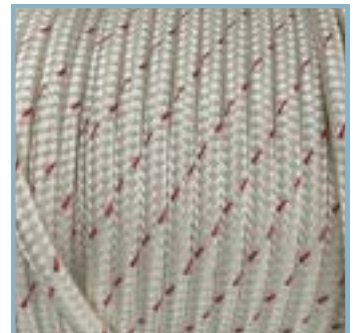
3/8" Double Braid