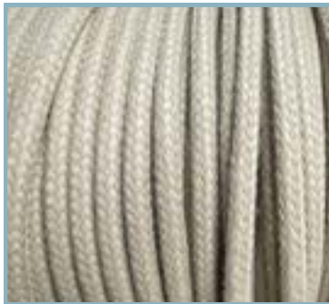
1/4" Vintage Double Braid