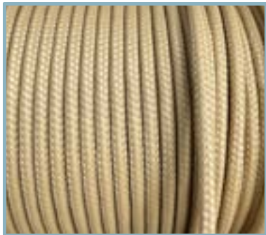
3/16" Vintage Double Braid