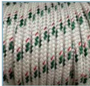
5/16" Double Braid